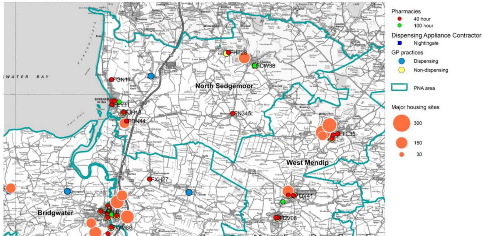
Figure 1: North Sedgemoor PCN Pharmacies (40 and 100 hr), dispensing doctors, GPs, housing sites